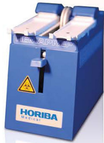
Blood Smearing System for Hematology