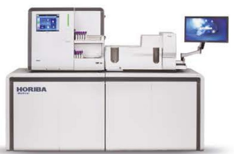
Yumizen H2500 Yumizen SPS