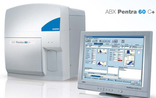
ABX Pentra 60 C+