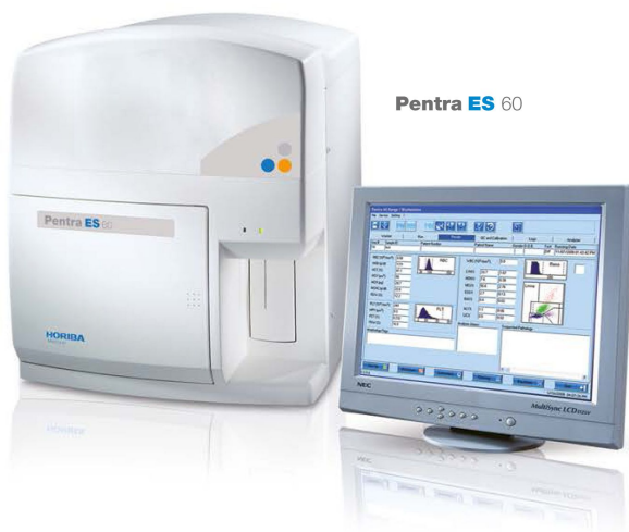
Pentra ES 60