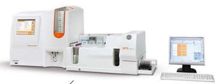
Pentra DX Nexus SPS Evolution