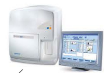
Pentra ES 60