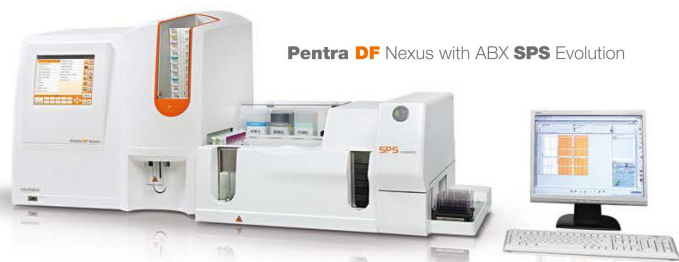
Pentra DF Nexus with ABX SPS Evolution