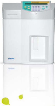
ABX Micros 60