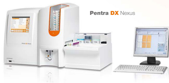
Pentra DX Nexus

120 tests/hour 50 parameters Expert validation system (ABX Pentra ML)